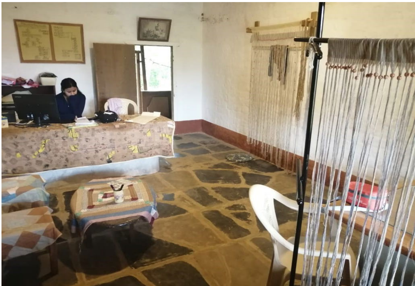
Production Manger office at CFC