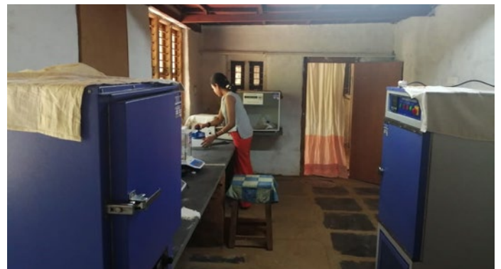
Inhouse Testing laboratory