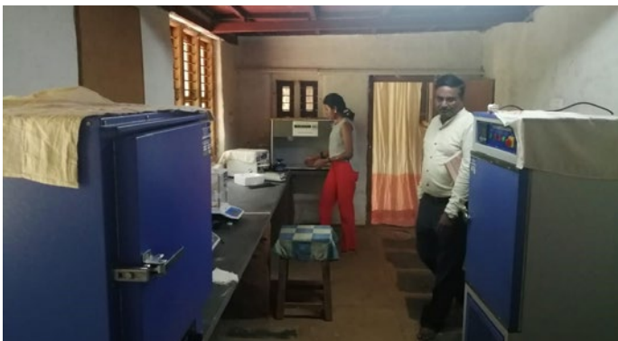
Inhouse Testing laboratory