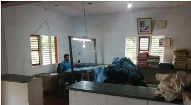
Fabric quality checking department