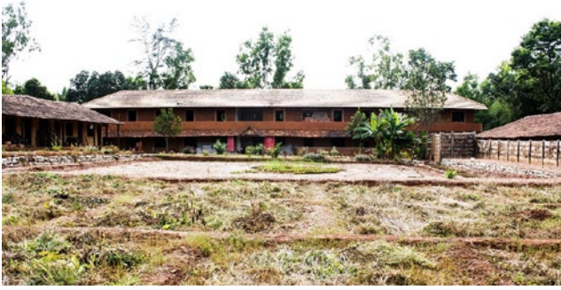
Common facility centre (CFC)