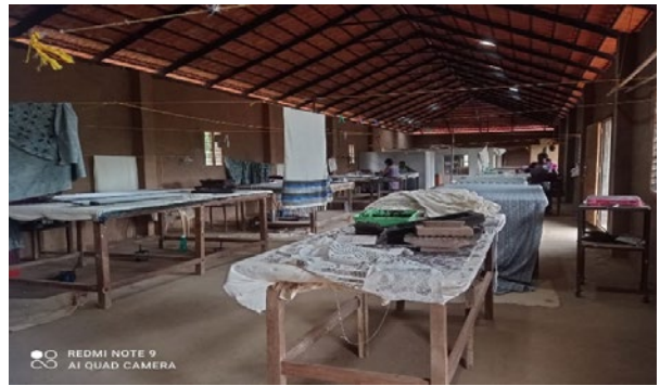
Wood block printing section