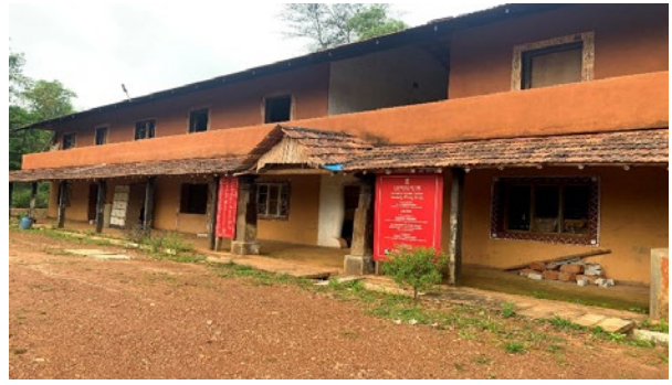
Common facility centre (CFC)